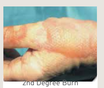
Injury to Finger